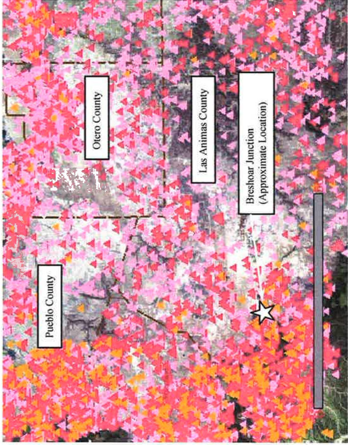
Plot showing well density in the vicinity of Beshore Junction, Colorado.